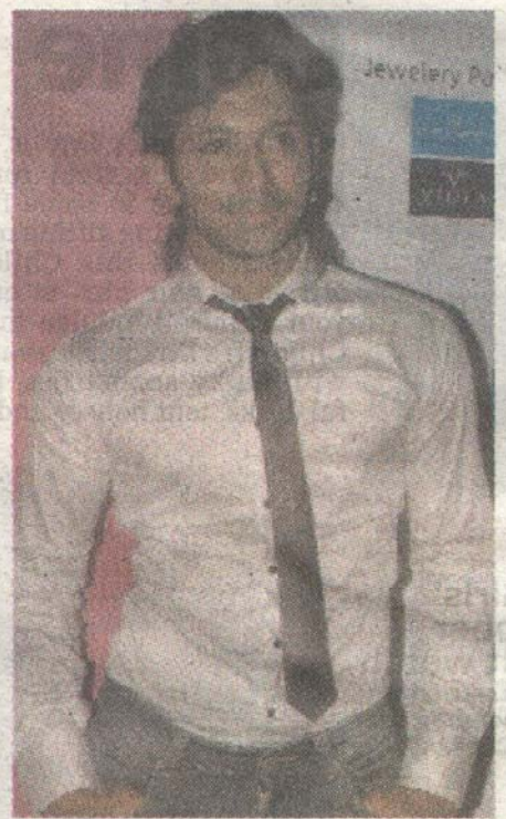
● Terrence Lewis

As befitting its title, there were plenty of fit and fabulous people around, beginning with the lovely Mandira Bedi. In a vibrant patterned dress that was more than a match for her striking personality, Mandy seemed like the poster child for yummy mummies. Also spotted at the do was a remarkably svelte Tulip Joshi (whatever happened to her movie career?). Dance guru Terrence Lewis and Ashmit Patel were some of the other celeb guests. An attendee was heard remarking that Ashmit, for a change, seemed to be okay with someone else hogging the limelight. Naughty, naughty!